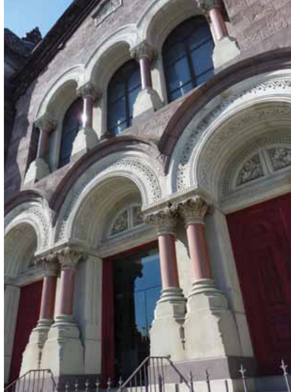
Congregation Rodef Shalom is one of several institutions in the Redevelopment Neighborhood Zone (left).