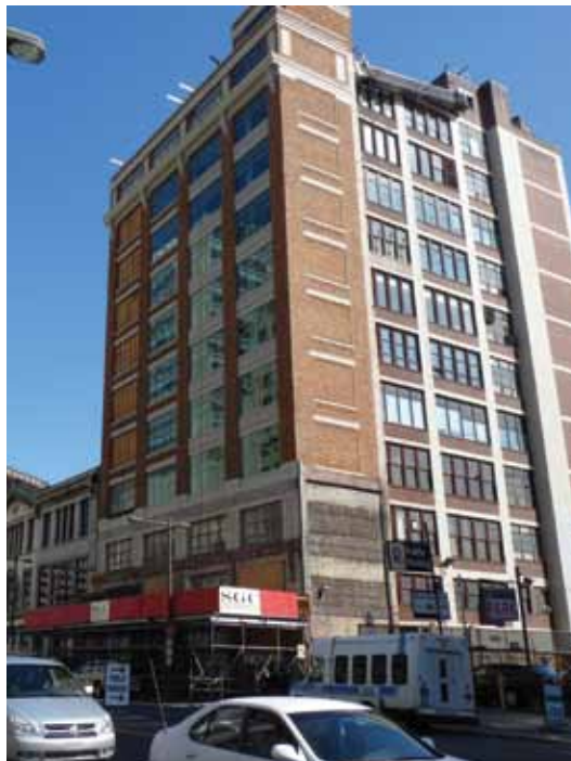
Hahnemann University Hospital is one of the anchors in the Convention Center Anchor Zone at the southern end of the study area.