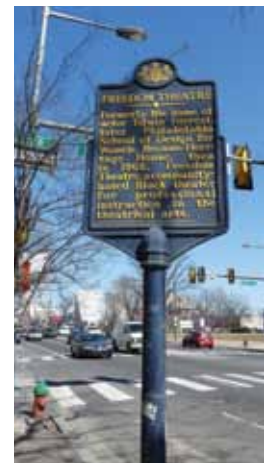
History is an asset the North Broad Street corridor can build on.