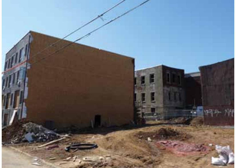
Vacant land is a problem in sections along the corridor.

Another key site in this zone is William Penn High School, on the west side of North Broad between Thompson and Master streets—a large facility, located on about ten acres, that graduated its last class in spring 2010. The reuse and redevelopment of this site could include an incubator lab or research facility, a new Philadelphia campus for a higher-education facility such as Penn State or Community College of Philadelphia, or a facility shared by the School District of Philadelphia and a higher education institution, plus public open-space recreation facilities for new development on Broad and the adjacent neighborhoods.