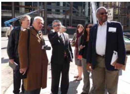
The Advisory Services panel tours the study area.

days and at different hours. During periods of peak demand (which can range from normal business hours to Sunday mornings), on-site parking is at capacity and there is spillover onto adjacent streets—although some patrons, many of whom travel from other Philadelphia neighborhoods or the suburbs, are leery of parking more than a block away from their destination. The presence of one of the city’s three subway lines would suggest that public transit is a good alternative to driving and parking; however, there are reasons why many do not consider this to be the case.