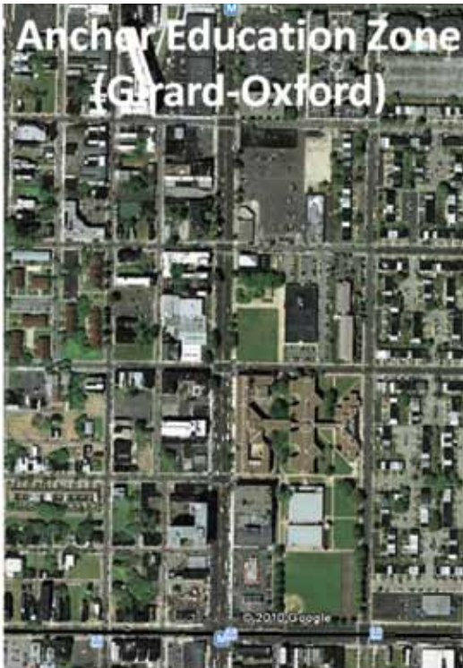
An aerial view of the Education Anchor Zone.