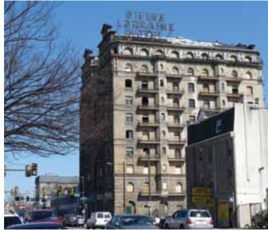
Six subway stations are spaced an average of a quarter mile apart within the study area of North Broad Street, though their entrances are not necessarily inviting (far left).