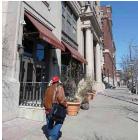
New development has occurred in the southern part of the corridor, near the strong Center City market.

sive toolbox of public financing tools and incentives that has stimulated a strong response by developers where markets are strong, such as Center City. Access to capital in neighborhoods with more perceived risk and lower rents is more challenging, and some projects have required significant public subsidy, such as the redevelopment of Progress Plaza.