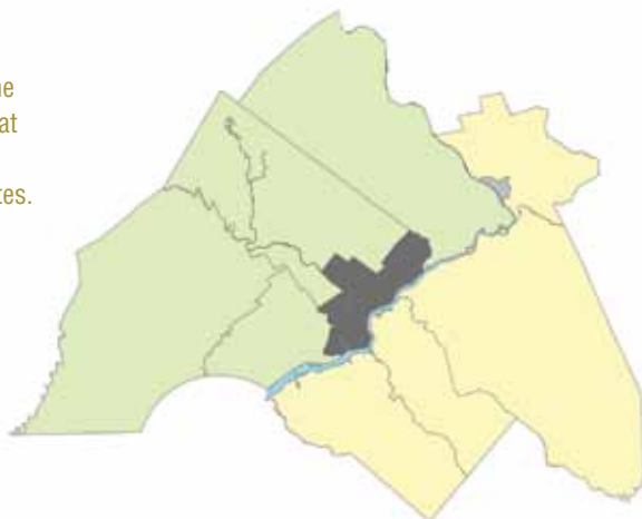
PHILADELPHIA CITY PLANNING COMMISSION

Philadelphia is at the heart of a region that encompasses nine counties in two states.