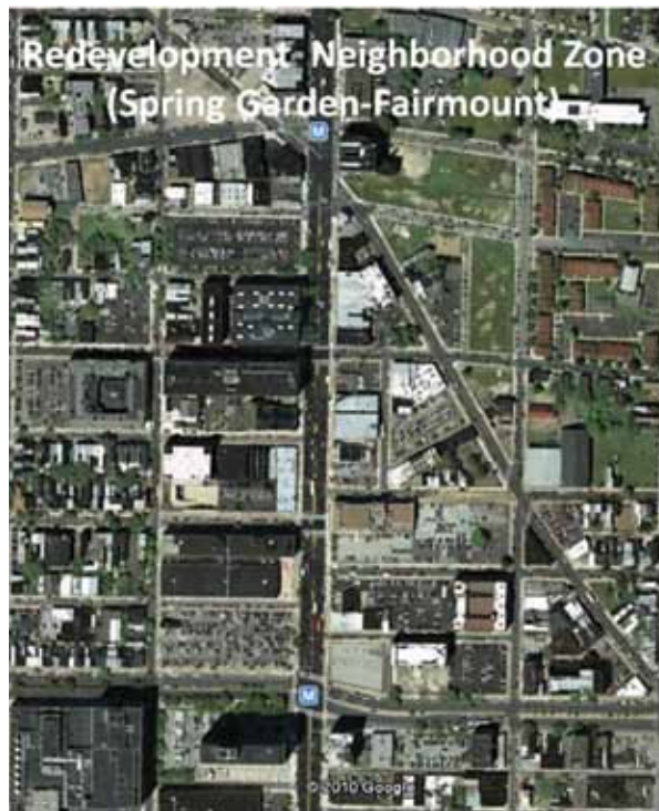
An aerial view of the Redevelopment Neighborhood Zone.

Vacant land in this zone needs to be maintained and kept clean to convey the right message to the neigh-