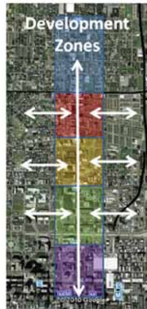
The panel divided the corridor into five development zones where different strategies should be pursued.