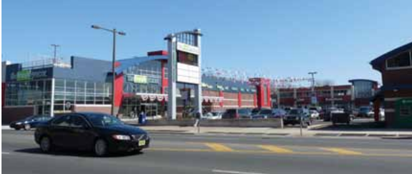
The redevelopment of Progress Plaza brought a new supermarket to North Broad (left). New commercial development about the Temple University campus (right).